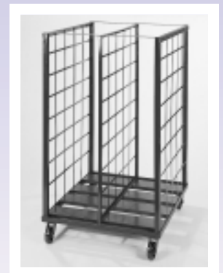
Mat Mover II