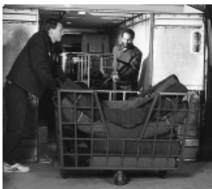
Burro Handtruck Standard Size