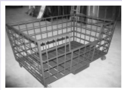
Burro Handtruck Oversized