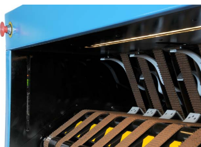
Safety sensor for auto-stop