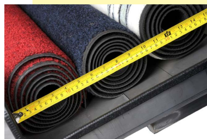
Tighter roll for sturdy core