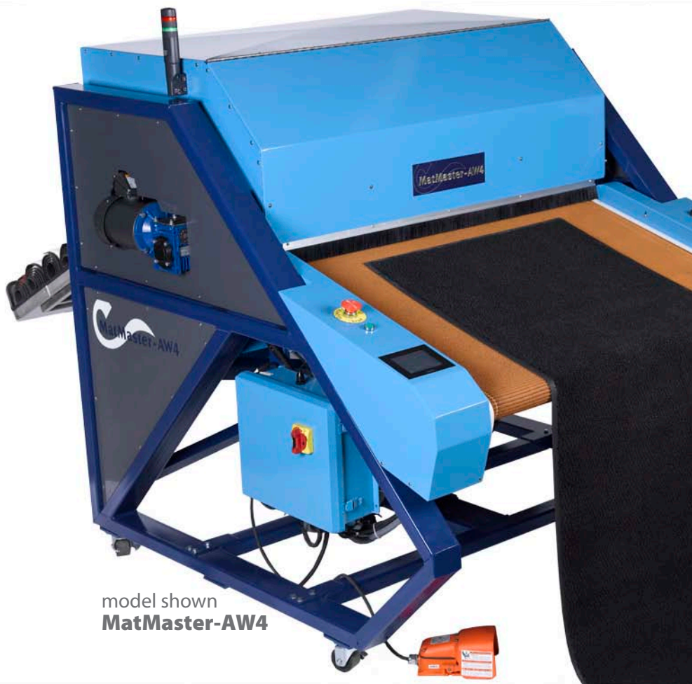
model shown MatMaster-AW4

Instead of returning to the operator, rolled mats automatically move to the next operation, increasing productivity and reducing labor.