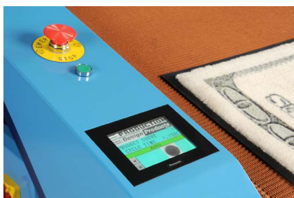
Touch screen operation